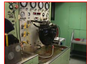
Blade Repair - Machining