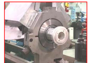
Heater Mat Replacement