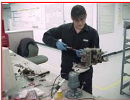
Blade Repair – Cold Rolling